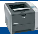
TROY MICR 3005 Secure Ex Printer