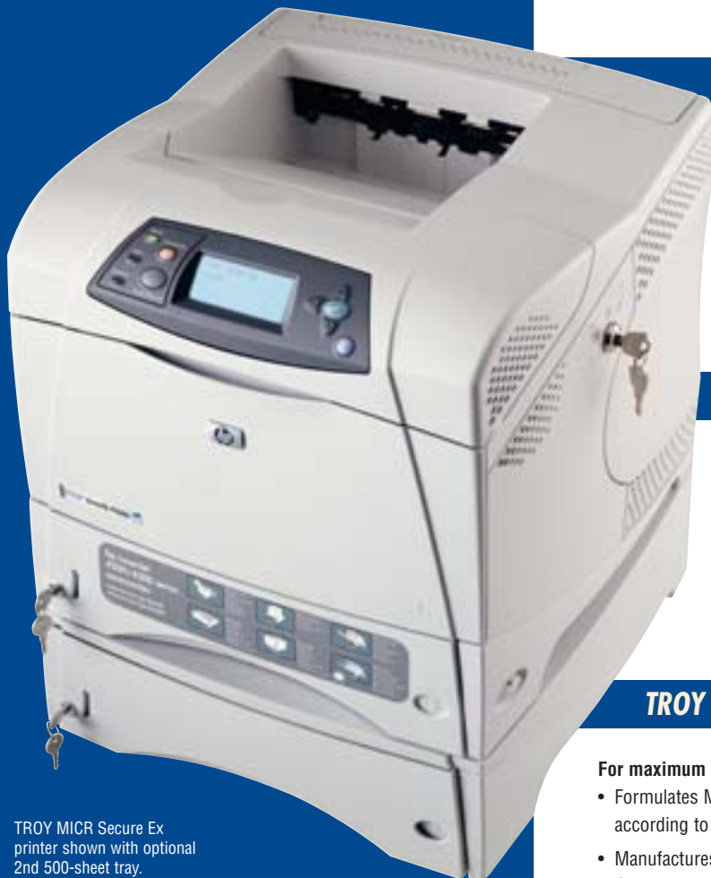
TROY MICR Secure Ex printer shown with optional 2nd 500-sheet tray.